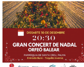
Partnership with Orfeo Balear