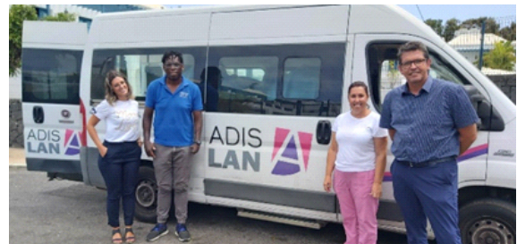
Clothing donation partnership with the Association for the Disabled of Lanzarote (Adislan)