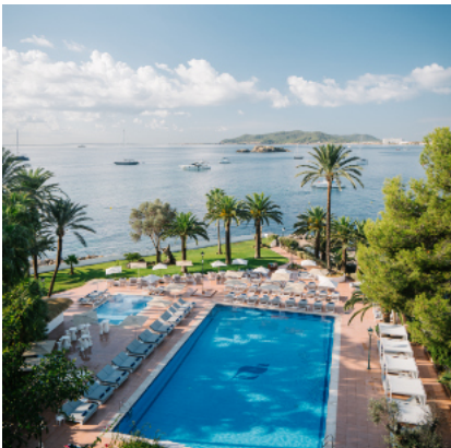
THB Los Molinos****