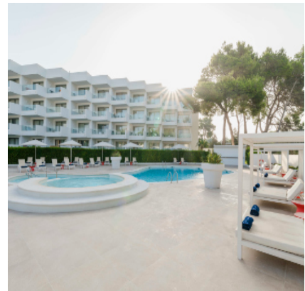
THB Naeco Ibiza****