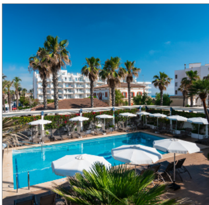
THB Gran Playa****