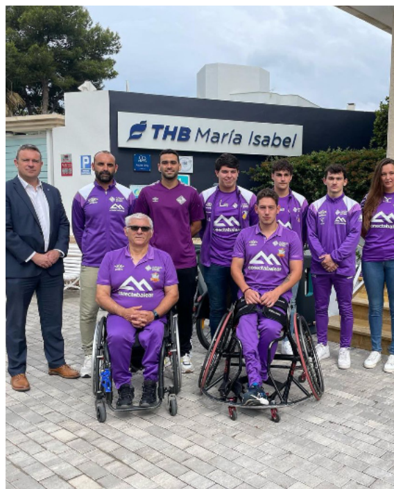
Sponsorship of the Fundació Palma Futsal and its sports team