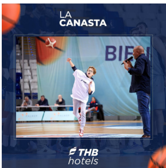
Sponsorship of Palmer Basket basketball team