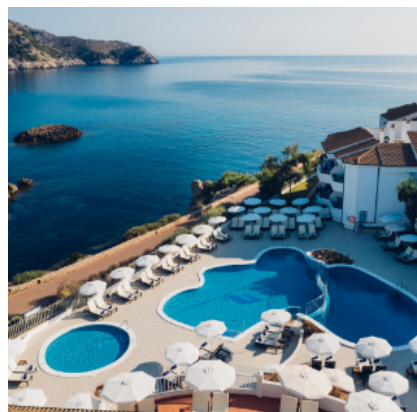
THB Guya Playa****