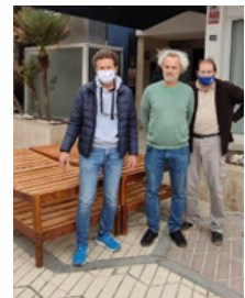
Donation of furniture for Ukrainian refugees