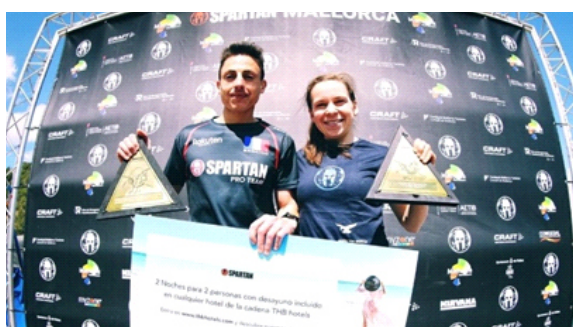
Participation in the Spartan Race Mallorca