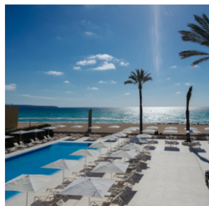
THB El Cid****