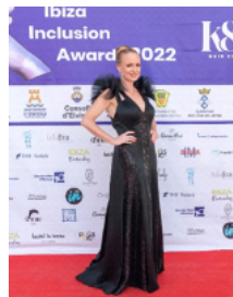
Sponsorship of the Ibiza Inclusion Awards event