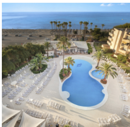
THB Sa Coma Platja****

✈ 1.542.883 stays in 2023 194 nationalities