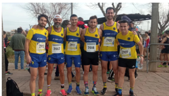
Sponsorship of the Endurance – THB hotels Sport Club running team