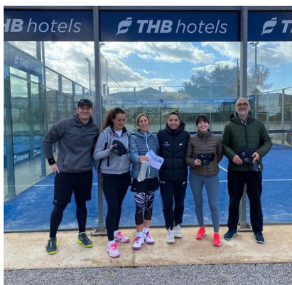
Sponsorship of the Rafa Nadal Academy padel ranking