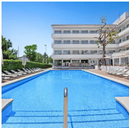
THB Dos Playas***