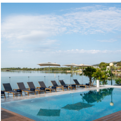
THB Bamboo Alcudia****