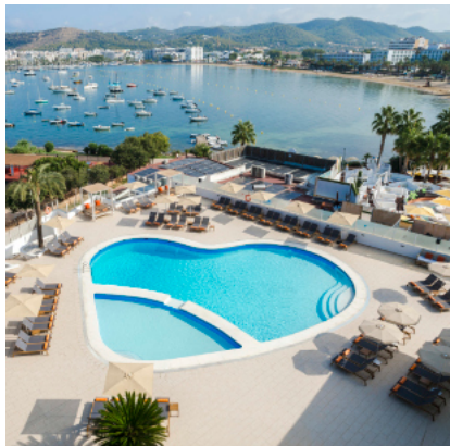
THB Ocean Beach****