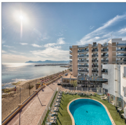
THB Gran Bahía****