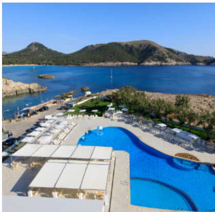
THB Cala Lliteras****