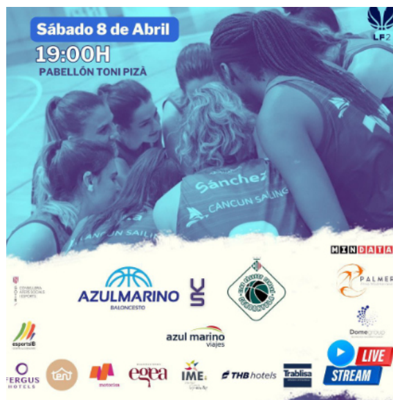
Sponsorship of Azul Marino basketball team