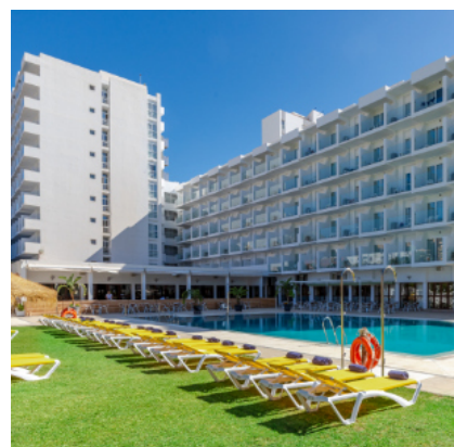
THB San Fermín***