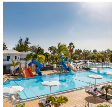
THB Tropical Island****