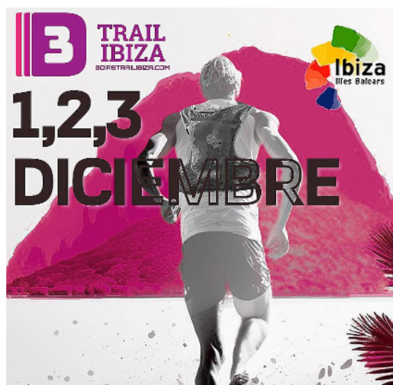
Sponsorship of the 3 Días Trail Ibiza race