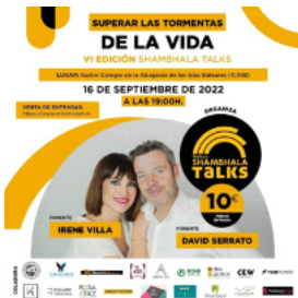
Sponsorship of the Shambhala Talks organised by the Shambhala Foundation